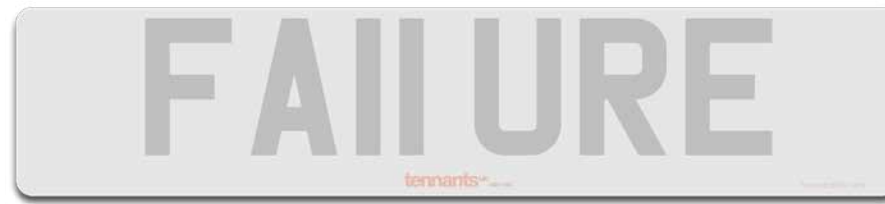
15. Non legal badges and the use of copyrighted images ❌